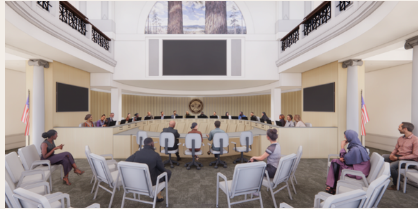
Rendering of new City Council chambers