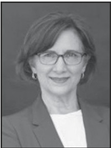
Suzanne Bonamici bonamiciforcongress.com

The climate crisis is an existential threat and a national emergency, and I will continue to work in Congress for meaningful steps to reduce emissions, transition to clean energy, grow the economy, and defend our planet for generations to come. As a member of the Select Committee on the Climate Crisis, I helped write and am working to implement our Climate Action Plan. The Plan includes more than 500 pages of detailed, science-based policy recommendations that cover each sector of the economy.