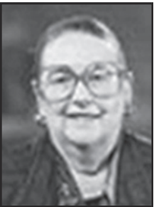
Betsy Johnson runbetsyrun.com

Our biggest problem is political extremism leading to dysfunction in the ability of government and its leaders to lead and solve problems like homelessness. The first step is to elect an independent governor loyal only to the people. I'll demand bipartisan support for budgets, legislation, and appointments. I'll lead with the best ideas from both parties. More voices will be heard, no matter your politics or zip code. The state budget will reflect this governing and leadership philosophy.