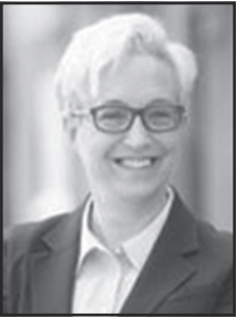
Tina Kotek tinafororegon.com

Oregon is facing major challenges. I'll be a force for positive change and deliver results. As Governor, I will: take on our homelessness crisis by increasing street outreach teams, expanding managed shelters, improving access to mental health services, and building more housing; deliver on our promise to expand access to addiction treatment and recovery services statewide; and fight climate change and create good-paying jobs in clean energy.