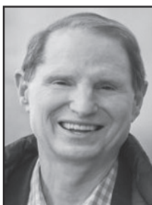
Ron Wyden wydenforsenate.com

As Chair of the Senate Finance Committee, I have led the fight to kill the fossil fuel subsidies that have driven the climate crisis. I authored significant pieces of the recently-signed Inflation Reduction Act, the biggest investment ever in the fight against the climate emergency. This landmark law will reduce energy costs, secure our energy independence, and drastically cut carbon emissions by 40%.