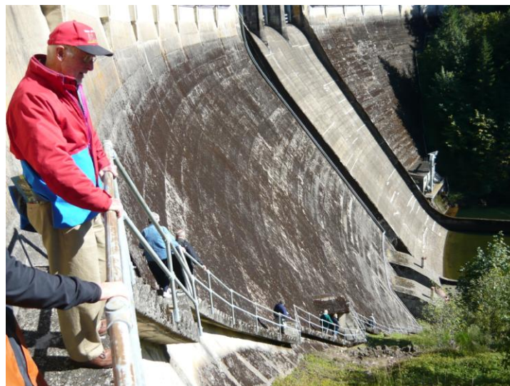
LWV Portland members descend down the dam during the Bull Run Watershed Tour.